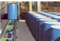
Chain conveyor / vacuum lifter